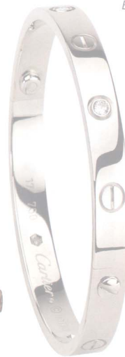
Cartier white-gold love bracelet From $4,200; Cartier, Americana Manhasset, 516-627-3200