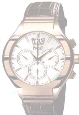
Piaget rose-gold Polo Chronograph $22,000; piaget.com