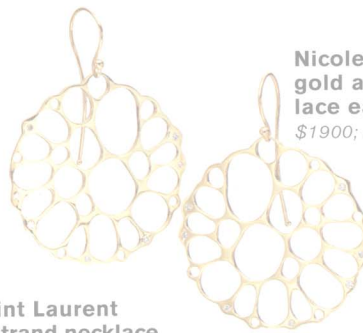
Nicole Landaw yellow-gold and diamond lace earrings $1900; info@nicolelandaw.com