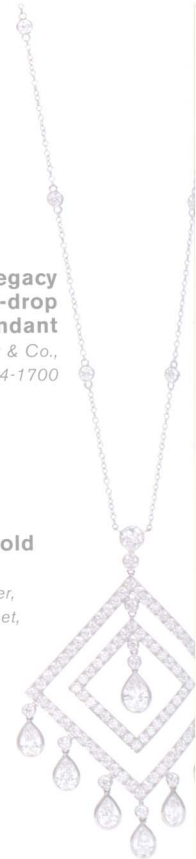
Tiffany Legacy diamond-drop platinum pendant $25,000, Tiffany & Co., East Hampton; 631-324-1700