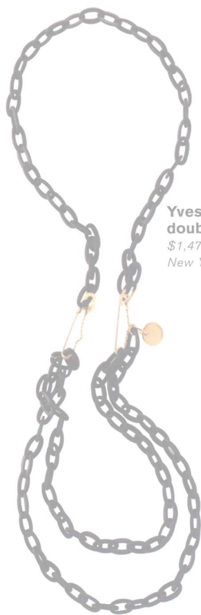
Yves Saint Laurent double-strand necklace $1,470, Yves Saint Laurent New York; 212-980-2970